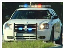
Hanover - New rule allows many Massachusetts residents to get car insurance at half-price.