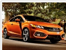
The 10 Best Cars Under $25,000