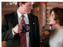
The Twin Peaks Revival Is Actually Happening