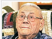
14 Benefits Most Seniors Didn't Know They Had