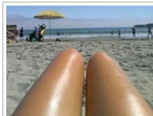
Women have been urged to cease posting these kinds of photos on social media.